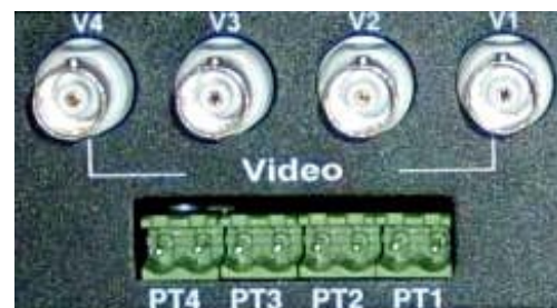
The RCA receptacle inside the securityProbe

Live full-color streaming video is available at up to 30 fps (320 x 240 resolution) via the web interface, and up to 50 streams of video can be accessed simultaneously. Standard JPG format pictures are used, allowing the use of third party host tools to store and analyze the JPG pictures. All pictures are in the Standard JPG format and the Standard CIF picture size is 352 x 288 pixels or VGA (640 x 480). The pictures can be easily downloaded from the securityProbe into a local host.